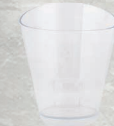
Boat ice bucket 1 - 420cl (T058) PP-PST