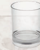
Whiskey glass 35cl (T015) POLYCARBONATE