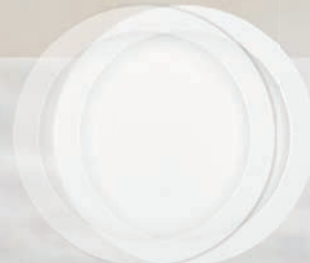
Plate 27cm (040LS) POLYCARBONATE