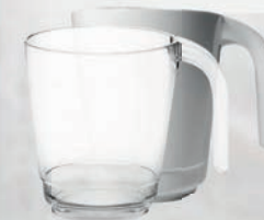
Cup (037LS) POLYCARBONATE