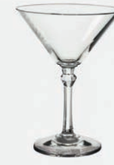
Cocktail glass (007LS) POLYCARBONATE