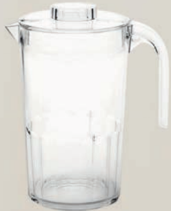
Jug Lid 1500cl (035LS) POLYCARBONATE