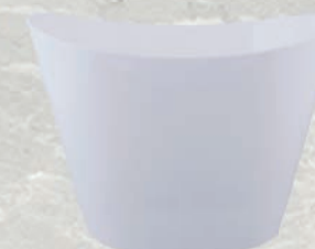
Boat ice bucket 2 - 800cl (T059) PP-PST