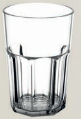
Graniti glass 49cl (022LS) POLYCARBONATE