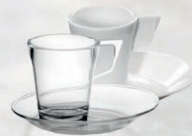
Coffee cup + saucer (036LS) POLYCARBONATE