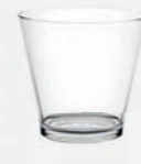
Cocktail glass 37cl (028LS) POLYCARBONATE