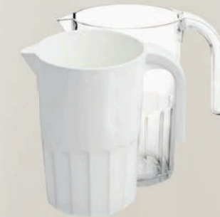
75cl jug (034LS) POLYCARBONATE