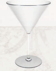
Cocktail glass 30cl (T007) POLYCARBONATE