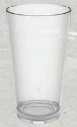
Premium Plus Tumbler 47cl (T030) POLYCARBONATE