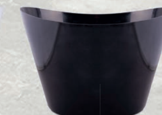
Boat ice bucket 4 - 1200cl (T060) PP-PST