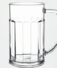
Beer Jug 35cl (033LS) POLYCARBONATE