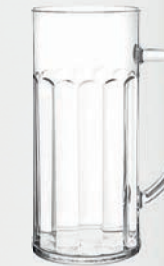
Beer Jug 56cl (032LS) POLYCARBONATE