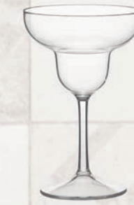
Margarita Glass 29cl (T012) TRITAN®