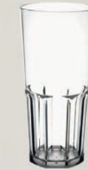
Graniti glass 47cl (023LS) POLYCARBONATE