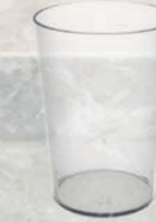
Mojito-Cider 60cl (T022) POLYCARBONATE