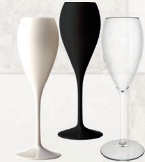
Cava Glass 20cl (T006) TRITAN®