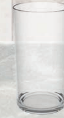
60cl Tube Glass (T018) POLYCARBONATE