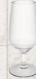
Vienna Beer Glass 40cl (T009) TRITAN®