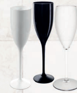
Flute Cup 18cl (T005) TRITAN®