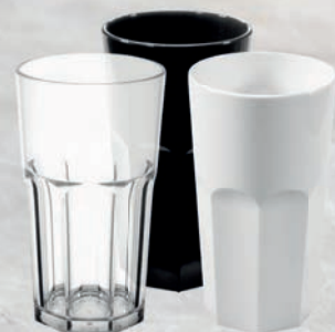
Bread glass 33cl (024LS) POLYCARBONATE