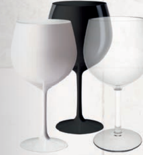
Copa Ballon 70cl (T003) TRITAN®