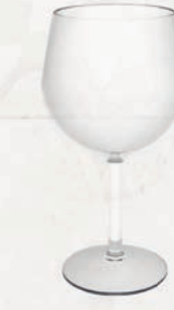
Copa Ballon 45cl (T004) TRITAN®