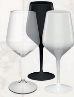
Cabernet Cup 40cl (T002) TRITAN®