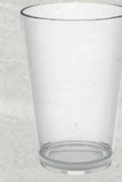
Premium 50cl (T029) POLYCARBONATE