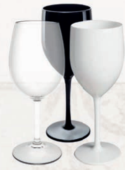
Water Cup - Wine 45cl (T001) TRITAN®