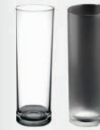
22cl Tube Glass Frost effect tube glass 22cl (030LS) POLYCARBONATE