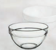
Bowl 18cl (039LS) POLYCARBONATE