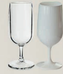
Wine Tasting Cup 18cl (008LS) POLYCARBONATE