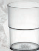
Eco glass 16cl (020LS) POLYCARBONATE