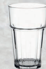
Classic Pan Glass 30cl (026LS) POLYCARBONATE