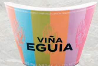
Boat ice bucket 4 - 1200cl (T060) PP - IML Customizable IML all the surface