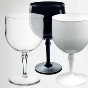
Gin Cup 70cl (003LS) POLYCARBONATE