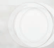
Plate 18cm (042LS) POLYCARBONATE