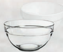
Bowl 62cl (038LS) POLYCARBONATE