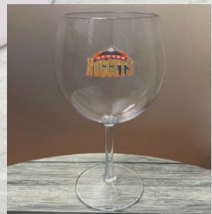
Full color digital