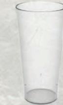
Long Soft Drink Tumbler 40cl (T025) POLYCARBONATE