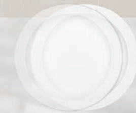
Plate 24cm (041LS) POLYCARBONATE