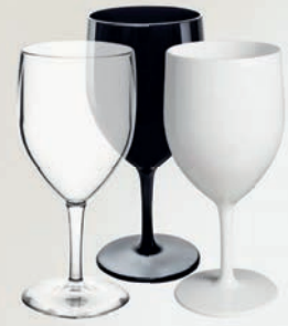
Water Cup - Wine 29cl (001LS) POLYCARBONATE