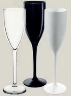
Cava Glass 15cl (005LS) POLYCARBONATE