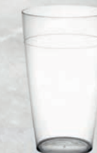
Eco glass 30cl (019LS) POLYCARBONATE