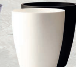
Amphora and tulip ice bucket 450 cl (T056/T057) PP-PST