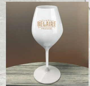
Screen printing / pad printing